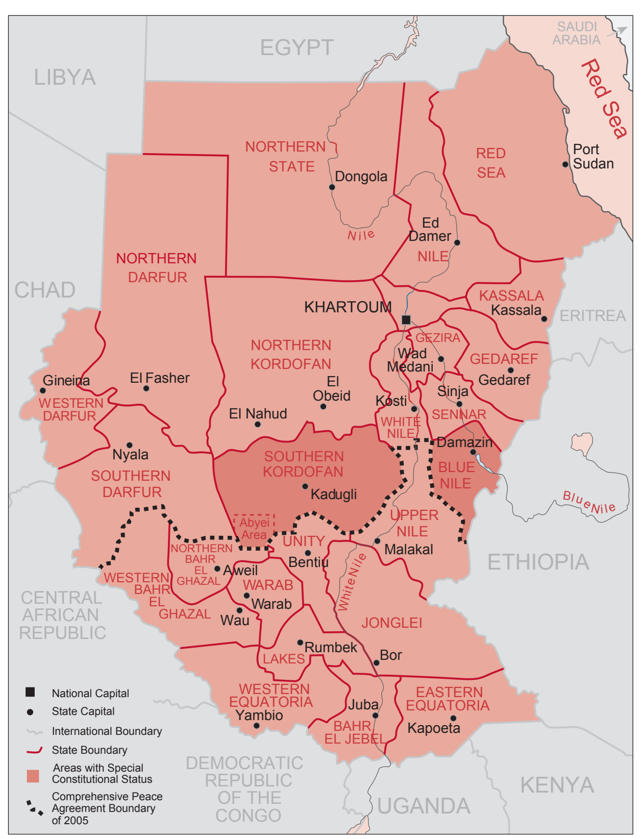
FIGURE 1 Sudan—Provinces, Main Towns and CPA Boundary